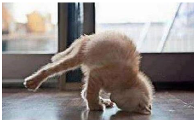
Yikes! Front brakes locked up again!

Don't wait until your brakes make funny noises, start grinding or pedal starts pulsating to have them inspected. Worn brake pads or other braking components can result in longer stopping distances, which is a safety concern.